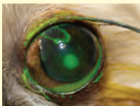
Fluorescein showing up an area of damage on the cornea

Happily, diagnosis of this condition can be made using a simple test to measure tear production. The good news is that medication for 'dry eye', usually in the form of an ointment, can improve tear production and reverse many of the signs of 'dry eye', maintaining vision and keeping pets comfortable.