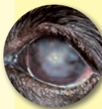
Dry eye with a dull lustreless eye and mucoid discharge