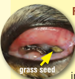
Foreign bodies in the eye such as grass seeds cause intense irritation and need prompt removal or corneal damage can occur