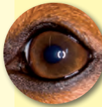
Healthy eyes should be bright, clear and free of excessive tears

Early diagnosis is the 'golden rule' with eyes; for example early diagnosis and treatment of dry eye can make a real difference to the vision of affected dogs. Without appropriate treatment, eye diseases can progress quickly as the eyes are particularly delicate and can be slow to heal and recover. Don't delay! If your pet is showing any symptoms of eye problems, come and see us for a thorough health examination.