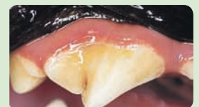
Figure 2: Gingivitis with early calculus