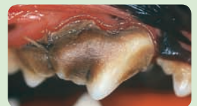
Figure 3: Periodontitis with very inflamed and receding gums