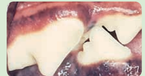
Figure 1: Healthy mouth