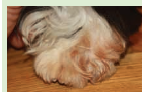
Paw chewing in a dog: Discoloured hair is a sign of excessive grooming.