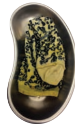
A very expensive sock that was removed from the intestines of a dog

So – as well as trying to ensure your pets don't eat these objects, we strongly recommend pet insurance to cover you against these unexpected eventualities!