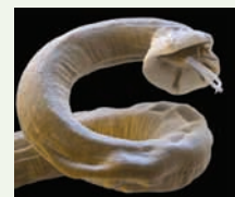
Electron micrograph of an adult lungworm

Once swallowed, the larvae migrate to the heart where they will develop into adult