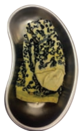
A very expensive sock that was removed from the intestines of a dog

So – as well as trying to ensure your pets don't eat these objects, we strongly recommend pet insurance to cover you against these unexpected eventualities!