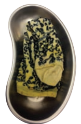
A very expensive sock that was removed from the intestines of a dog

So – as well as trying to ensure your pets don’t eat these objects, we strongly recommend pet insurance to cover you against these unexpected eventualities!