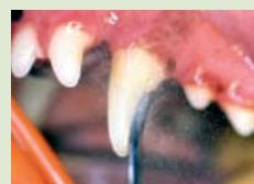
Scale and Polish: Removing the calculus using an ultrasonic scaler, followed by polishing, is a very effective form of treatment