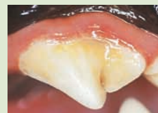
Gingivitis with inflamed gums