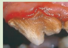
Periodontitis with gum loss