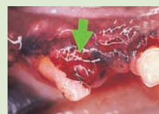
Tooth resorptive lesions Typical lesion (arrowed). The tooth is progressively destroyed and is usually very painful.