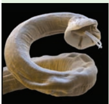
Electron micrograph of an adult lungworm

Lungworm are swallowed as tiny larvae, which migrate into the circulation of the liver and travel to the right side of the heart. Here they develop into adult worms (see photo left) which can build up in the heart. Here the adults mate and produce eggs. The eggs hatch into larvae and then migrate into the lung tissue. These larvae are coughed up and are passed out into your dog's faeces to re-infect molluscs.