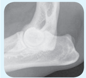
X-ray of a normal elbow joint

Radiography is commonly used to investigate joint problems.