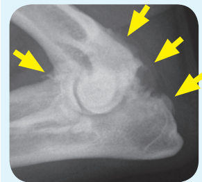
Arthritic elbow joint in a dog with lots of "fluffy" new bone (yellow arrows) around the joint, indicative of marked arthritis.